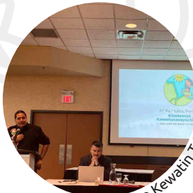
Presenting to Kewatin Tribal Council