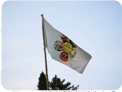
5 Nations Gathering Flag

We are uniting as five Nayhenaway Ininisewinuk / Cree Nations to celebrate our common history, culture, and connection to Askiy. Together we are working to create a new Indigenous Protected Area in our shared ancestral homelands along the Hudson Bay coast.