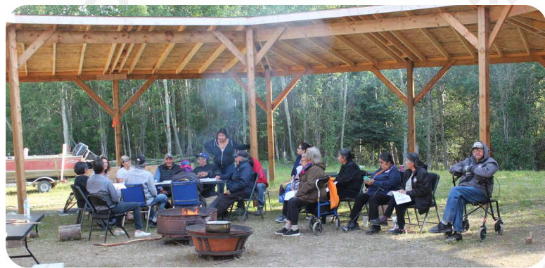
Elders at 5 Nations Gathering 2022