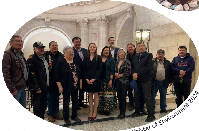
Meeting Minister of Environment 2024