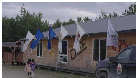
Fox Lake Culture Camp