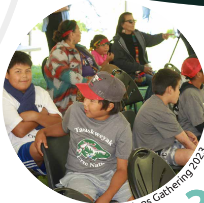
5 Nations Gathering 2023