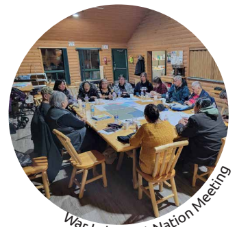
War Lake First Nation Meeting